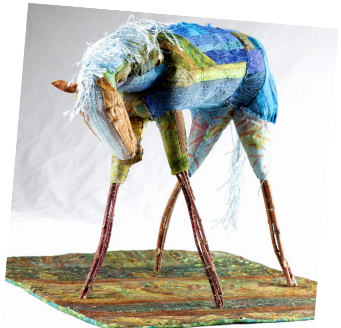
Christina Brown (Oregon, USA) - View from Horseback of Rowena Crest