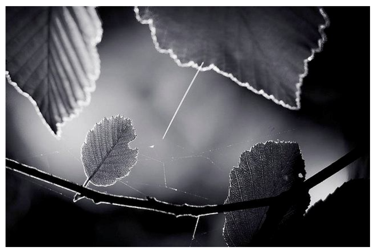
"communication"

Through communication, we do more than transmit information and ideas. Communicating allows us to make connections with other people and the world around us. These connections foster different sorts of relations – some more academic, intellectual, professional, and formal; others more creative, responsive, personal, and fleeting. In this sense, communication inspires different modes of engagement. This course approaches oral and written communication as a rhetorical enterprise – we will speak and write to inform, persuade, and inspire while attending to concerns of exigency, context, and audience. We will also consider how oral and written communication shifts in digital environments. Through the course, students will become more effective communicators and thus better prepared to engage with and respond to the world around them intellectually and creatively.